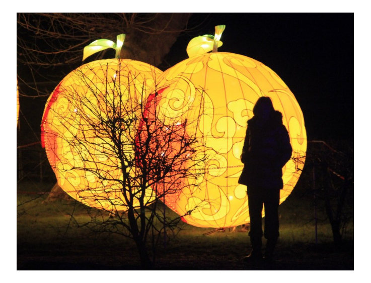
Record Visitors for the Lantern Festival

The Magical Lantern Festival, celebrating the Chinese Year of the Monkey, has been thrilling audiences in the gardens after dark for the last five weeks.