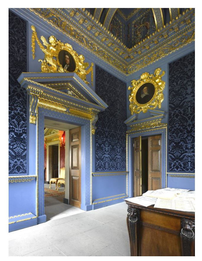
William Kent's Blue Velvet Room at Chiswick

An exhibition of Kent's work has opened at the V&A Museum and will run until 13<sup>th</sup> July. The House and Gardens will feature throughout the exhibition with some of the best examples of Kent's designs.