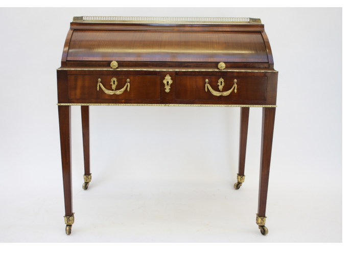
A Ladies' roll-top writing desk, veneered in fiddleback mahogany with gilt-bronze mounts, c.1785.

As the photograph above shows, by the 1890s some of the chairs had been grouped in the Bedchamber at Chiswick together with a small ladies' writing desk. The chairs, roll-top writing desk and a parœl-gilt and simulated rosewood pole-screen have been now been returned to the Bedchamber – their last known location in the house.