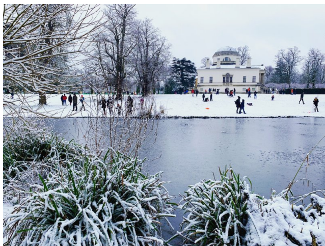
Icy Water

All the coots are on nests. The Egyptian geese have not been seen for a while: perhaps they have not found a suitable nesting tree and have flown away to breed. The overwintering shoveler duck have flown away as have the little grebe pair.