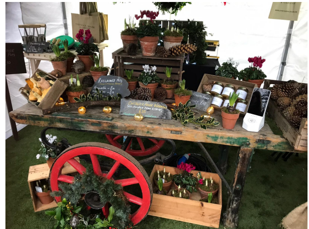
December Duckpond Market vegetable stall

With thanks to our Culture Recovery Grant, we have been able to fund Neena Sohal and Rinku Mitra, well established community outreach practitioners in the local Boroughs, to consult with local community groups, colleges, schools and our volunteers. Their findings will feed into our plan to expand our volunteering and community outreach activities. Once the plan is defined, we will need to raise funds to deliver the programme. In the meantime, we have been so lucky that our volunteer gardeners, kitchen gardeners, rangers and beekeepers have continued to volunteer when they can. We are working towards having all our volunteers back soon, as well as welcoming new volunteers.