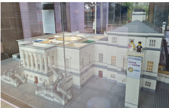
LEGO model in the Chiswick House cafe

The average donation rate for quite a while has been £50 per day, which means we should reach our target late in 2022. You can of course speed that up by buying more bricks today! (at JustGiving.com, Chiswick House Lego Model).