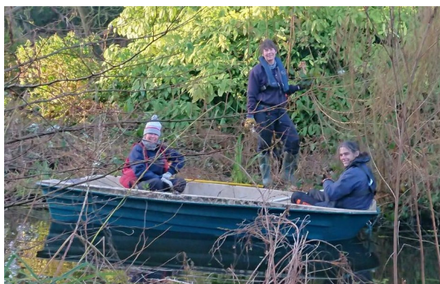
Three Gardeners in a Boat

The male mallard, which outnumber females by six to one, are squabbling over breeding rights. One of the females has had a broken wing for about 18 months. Despite this she seems very fit and a source of interest for the males.