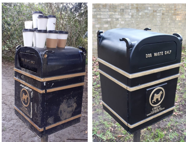
Dog bins before and after repainting

The Dog Show Committee responded to the CHGT appeal for help with the £16+k annual DWM cost, and via the Friends £5,000 was contributed in this extraordinary Covid and dog year. This includes a £400 donation from a charitable trust designated for 'dog-related activities' - which neatly turns out to match the cost of this spring's painting of the bins.