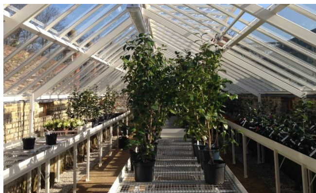
Inside the restored Melon House

We raised substantial funds over ten years by running the Friends Opera over one, and later two, evenings. Our stalwart Opera Committee - now sadly disbanded - was keen to fund a single large project with some of the revenue, and over the period 2014/15 suggested that we should donate £100,000 towards restoration of the Melon House. This was originally built in the nineteenth century and provides much needed propagation space for the Gardens. It has now been brilliantly restored.