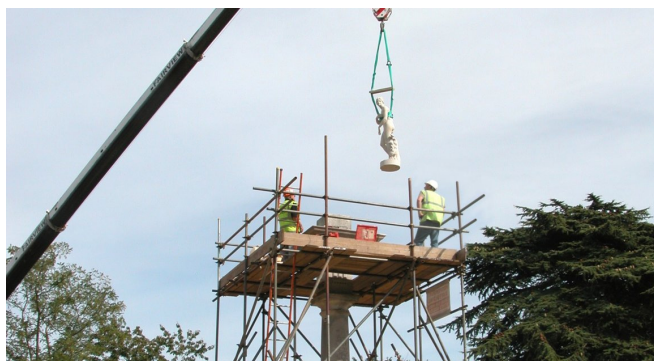
Installation of the Venus de Medici

In 2009, we commissioned and installed a replacement Venus statue for the Rose Garden from a sculptor in Yorkshire who carved the figure from a slab of Portland stone. In September this year, she will have been in place for 10 years!