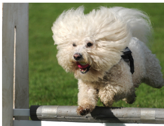
The Friends Autumn Dog Show

We have always supported those stalwarts of the Gardens, the dog-walkers, and we installed the black dog-litter bins at the time of the Lottery project. We also host the annual Dog Show - now the most popular of its kind in West London, and our brilliant Dog Show team is already planning the September 2019 event.