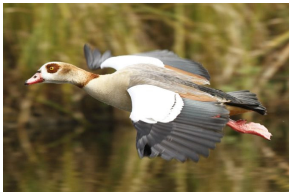
Egyptian Goose

Our other winter residents, Shoveler and Little Grebe, have left. There has been no sign of any Kingfisher, but our Brentford-based Herons are daily visitors and the Cormorants feature regularly.