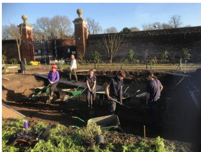
Hard work digging the Knot Garden

Over the last few months, our gardeners, assisted by our valued volunteer team, have been preparing the Italian gardens, tending the camellias (including lots of leaf cleaning) and trimming the trees on Dukes Avenue. In addition, many hours and lots of hard work have gone into the building of a Knot Garden in the Kitchen Garden. Knot Gardens are gardens of formal design in a square outline, and are Tudor in origin. Our Knot Garden is designed to reflect the floor plan of Chiswick House, and will be grown entirely of edible herbs and plants. Please come and visit it on one of our Kitchen Garden Open Days.