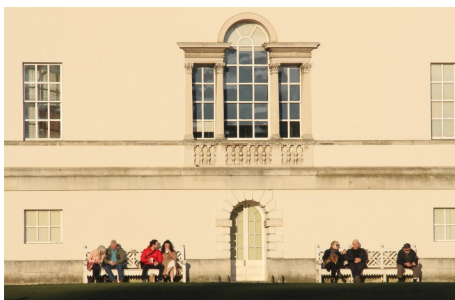
Pair of benches on the SW wall of House

We have always appreciated garden furniture, and designed and commissioned three benches over the years - two for the House and one for the Patte d'Oie in memory of Ted Fawcett. The House benches were installed in 2005, see below: