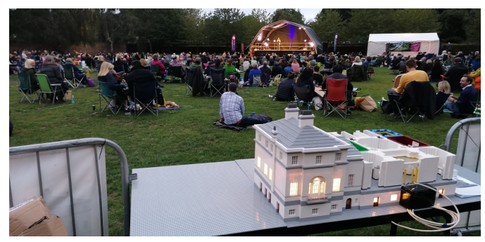
Model at the Chiswick Festival, August

The model build continues apace as we enter our fifth month of fundraising. Since June, we have raised over £21,000 in on-line donations, plus £3,000 in off-line donations and another £1,500 promised. In the photo above, the main House (with the steps) is almost all donated, the East Wing has been built for show, but is not yet donated, and the West Wing and Summer Parlour / Curved Corridor have just been outlined in bricks to show where they will go.