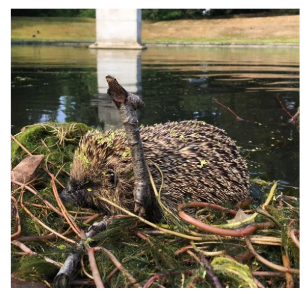
Hedgehog in coot's nest on the Amphitheatre Pond

In August, the Amphitheatre pond ramp, which is secured to the edge to allow water bird young to climb out of the water, was seen floating in the pond.