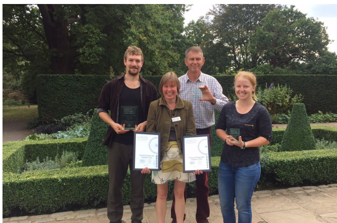
London in Bloom Awards

Hot off the press - the Trust collected a number of awards at the prestigious London in Bloom Ceremony, receiving Golds for the Walled Garden and Heritage Garden of the year categories. The estate also won the overall Heritage Garden of the year 2016 in their category.