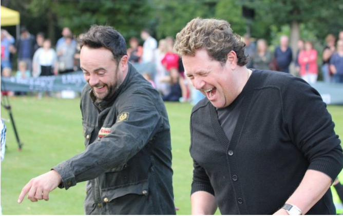
Ant McPartlin and Michael Ball judging the Talent