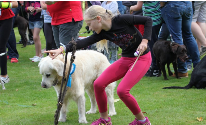
"Go, Rex, go!!"

The My Dog's Got Talent ring, judged by Ant McPartlin and Michael Ball, saw many demanding turns, from 'General Tricks' to 'Walking and Sleeping'.