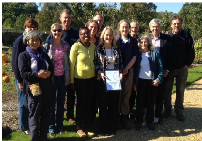
One of the Garden Tour Groups

We are pleased to announce record attendance for our events, tours and visits: 60,000 visitors to the House and the Gardens throughout the year. The magical Giffords Circus and Luna Cinema both came here for the summer season, boosting visitor numbers by 15,000 and delivering new audiences and income, with both events already rebooked for 2016. We are also proud to have attracted 1,200 school visits and nearly 3,000 visitors to our Kitchen Garden because of the extended opening hours and the